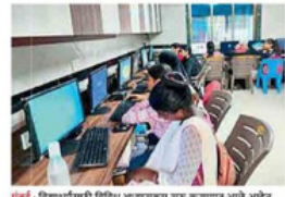
मुंबई : विद्यार्थ्यांसाठी विविध अन्नासक्षम सुरु करण्यात आले आहे.

डी बीएम इंडिया संस्थेने आपल्या कार्याची मुळावा साही कमी मानव विकास निर्देशांक असलेल्या मुंबईतील एव पारिजातपूर, बेरी, सुककातेला पाच वर्गोक्त बालसंस्थेसाठी कोरोनापूर्वीतील राज्या दलक घेऊन निवडून मुलांना अनेक कार्यक्रमांच्या माध्यमातून त्यांची सक्षमतांचा एका विविध पातळीवर आणले. त्यासाठी विविध उपक्रम राबविले. २०२० मध्ये एका शाळेच्यातून बालसंस्था सुरुवात करण्यात आता शाळांमधील अन्नपत्रक वाटप सोडविले आहे. या वाटपानेच संस्था आज दररोज दोन हजार मुलांमध्ये काम करत आहे. मुलांच्या सर्वांगीण शिक्षणसक्षमतेवरच त्या संस्थेने भर देत त्यांच्या सक्षमतेवरच चर आहे. त्यासाठी संस्थेने दररोज दोन हजार विद्यार्थ्यांना भोजन पुरविले जाते.